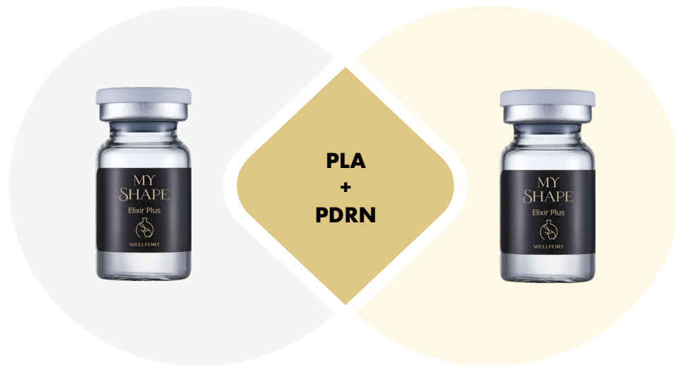
MYSHAPE Elixir Plus Collagen Stimulator